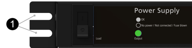
Installation in 19" rack.

The unit must be mounted in a 19" rack. Bracket is screwed into rack with M6 screw and basket nut, at least one on each side. Use the appropriate screw and nut for the rack. Screw and nut not included.